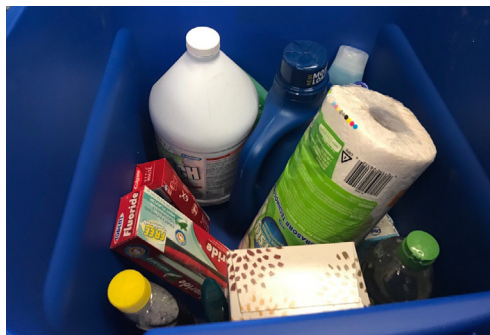
Baskets provided much-needed household and hygiene products

The donation in Montana helped support the needs of the most vulnerable during the COVID-19 pandemic, including seniors on fixed incomes and low-income families. Baskets filled with household cleaners and hygiene products, such as toothpaste, dish and laundry soap and shampoo, were distributed during the third week of May to families in need. They were able to drive up and receive the products.